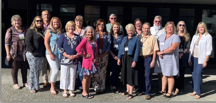
Kentucky and Three Rivers representatives at NALBOH Conference in Seattle, WA.